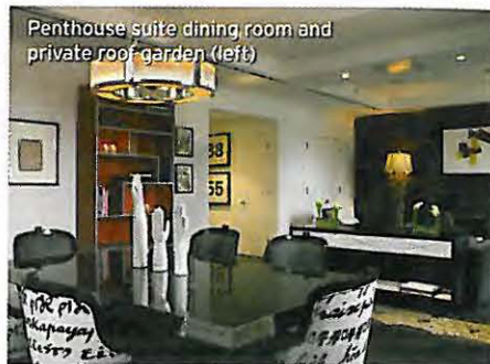
Penthouse suite dining room and private roof garden (left)

prix-fixe lunches ($28 and $35, respectively) make it seem like Restaurant Week all year. Café Boulud also oversees the 1,200-square-foot Bar Pleiades across the lobby, serving old-school cocktails in a very modern space. Rottet's bar design was inspired by Chanel makeup compacts, and poetry about Manhattan is stitched into the carpeting. Room service includes both Café Boulud meals and in-room cocktails; mixologists bring ingredients, serve a round and instruct guests on how to make their next round.