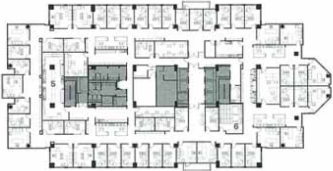
20th Floor Plan