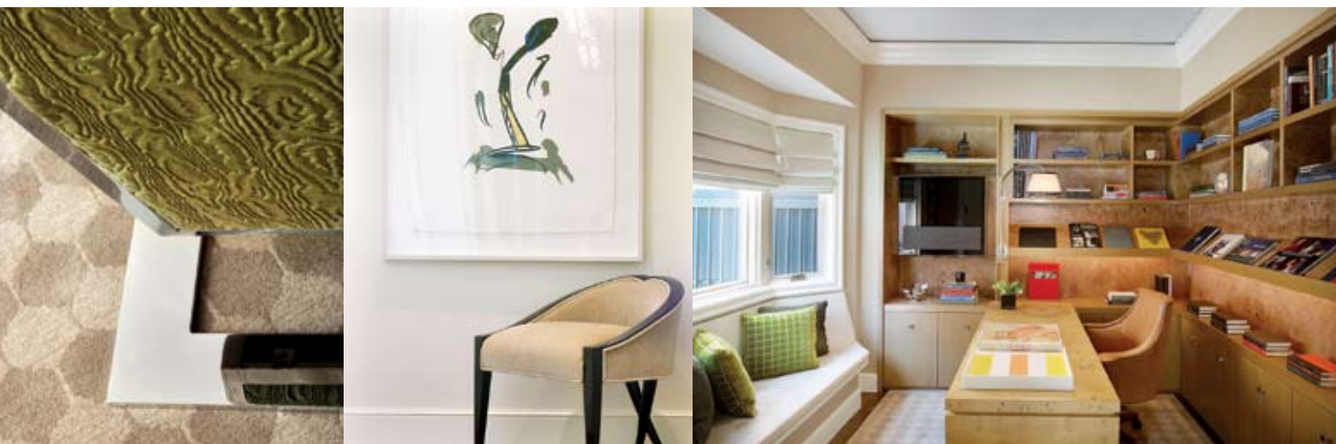
Left: Cut-pile wool uphsters a chair in the den. Center: A Claes Oldenburg and Coosje van Bruggen lithograph hangs in the foyer. Right: In the study, burl veneer backs compartments in the ash-veneered cabinetry.